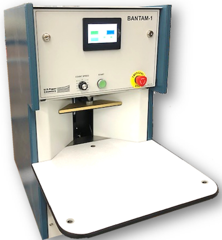
Shown without base stand